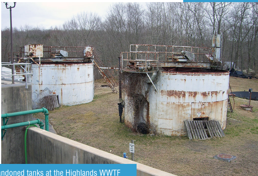
Abandoned tanks at the Highlands WWTF will be demolished for safety reasons.