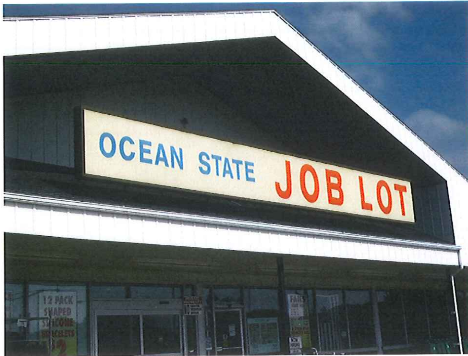
Old Ocean State Facade Prior To Improvements