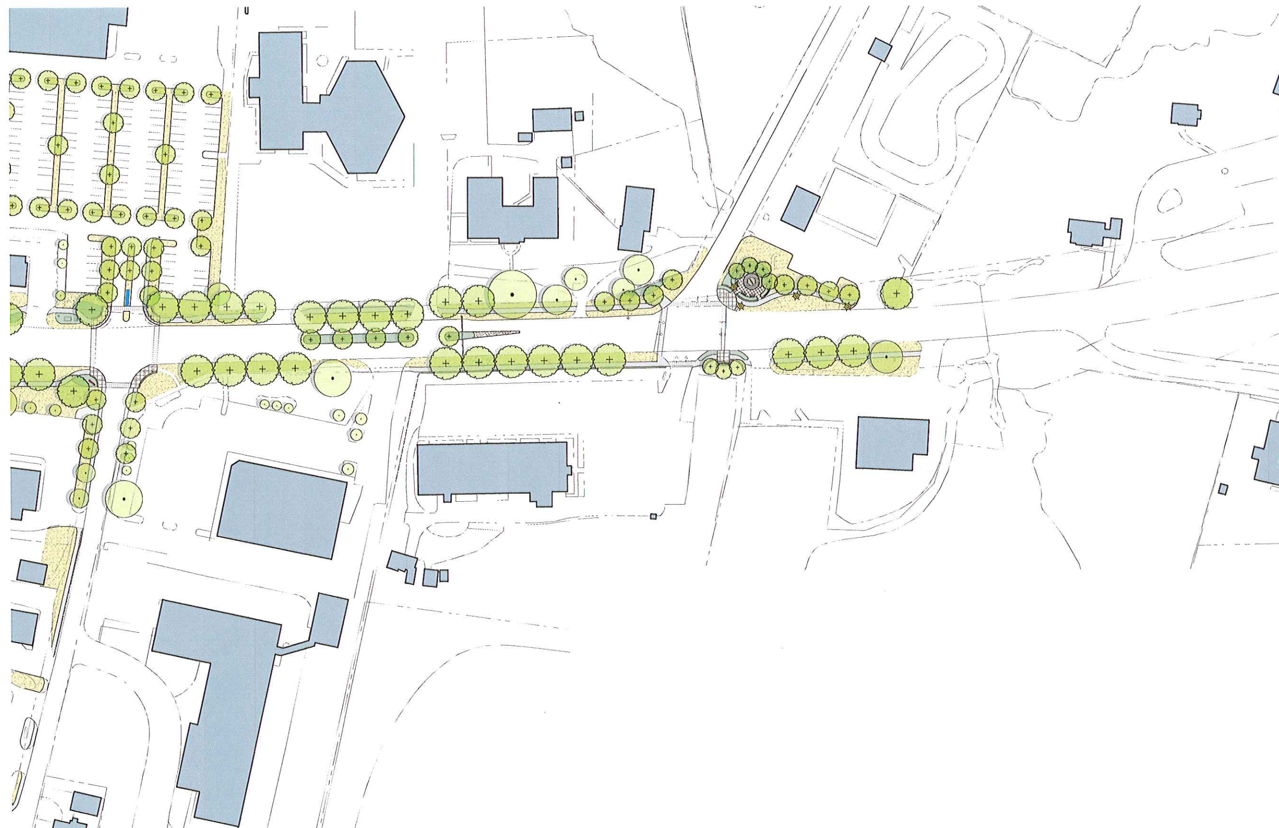
Gales Ferry Streetscape Vision Plan - South

Scale: 1" = 50' Date: 28 August 2012 K+F Project No.: 2311033 Drawing No.: